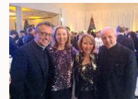
Don't miss the Grand Banquet at the Driskill!

Join us for all of the consecration festivities, from Friday's Vespers through Saturday's consecration, hierarchical divine liturgy, family event and banquet, and Sunday's hierarchical divine liturgy and the entertainment that follows. Sign up to volunteer, and to host our guests from out-of-town as they gather to help us celebrate this historic and joyous occasion.