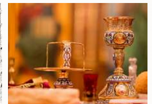
They will be remembered at every divine liturgy.