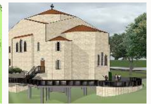
The walk-around will circle the entire church building.