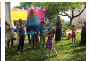
On Saturday, GOYA will host fun youth events.